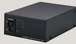
Camera Adaptor DC-700CE