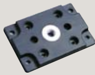
Tripod Adaptor VCT-ST70I